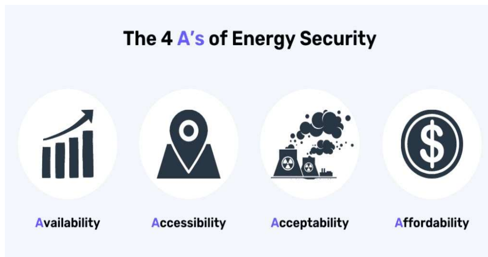
Figure 1: the four As of energy security 4

International Atomic Energy Agency, IAEA has defined energy security as, "uninterrupted availability of energy sources at an affordable price." 3