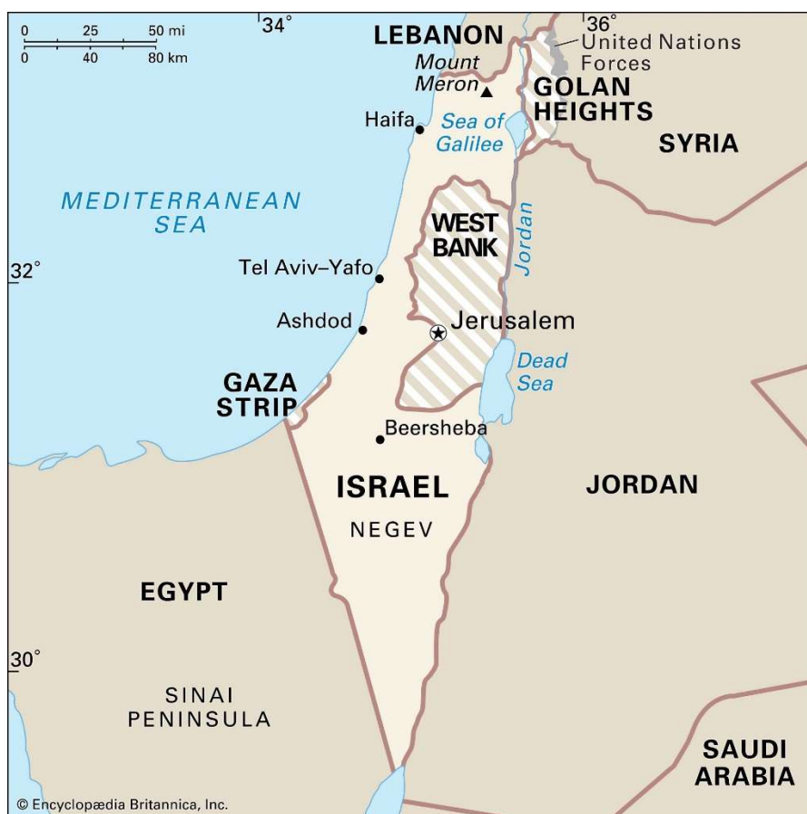
Figure 2: Israel-Palestine Region

West Bank, aims to improve trade and communication connections, potentially leading to positive economic and social impacts in the region. 13 Like this, China is also working on establishing industrial parks in the West Bank city of Jenin. It will increase job prospects for the population of the West Bank.